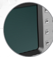
[Graphic Color LCD]